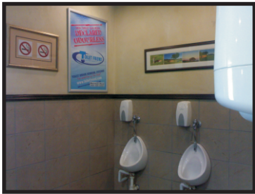
Toilet Friend units installed at the Mossel Bay Golf Club

BUY our Odour Removal System and save hundreds.