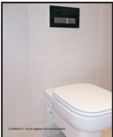
Gebberit 1 Pacif sigbaar uit skuins hoek

RENT our Odour Removal System and avoid the initial capital outlay required to enjoy the benefits of odour-free toilets & urinals in your workplace or home.