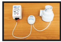
Transformer Infra-Red Sensor Extractor Fan

100% Effective on ALL Toilets and Urinals